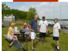
Sailors Talk Things Over After Saturday Races