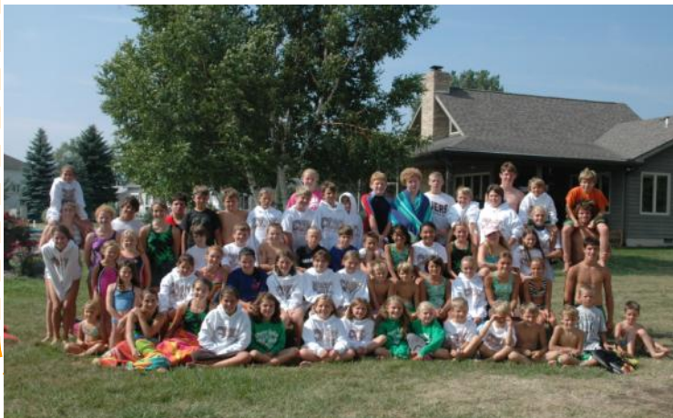
Clear Lake Ski Club Members — 2007